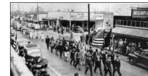
Military Parade marching down Third Street.

The Vernon Parish Veteran's Plaza was built to honor all Vernon Parish veterans. Since it was begun, the memorial has grown to contain seven stone tablets engraved with the names of Vernon Parish vets. At the site, the American flag towers above the flags of the five U.S. military branches, including Army, Air Force, Navy, Marines, and Coast Guard, as a POW flag flutters to the side, alone, but not forgotten.