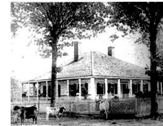
3. Smart Plantation House