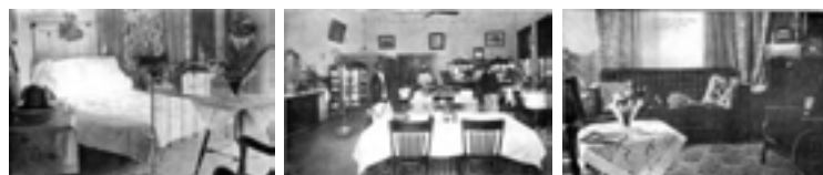
13. Interior shots of the National Hotel in its hey-day.

This hotel had thirty-five guest rooms and was the latest in high style when built. A combination of Mission and Classical style, the hotel originally had a large two-story porch with Roman columns in the center of the main façade. The infamous Bonnie and Clyde were among some of its most notorious guests.