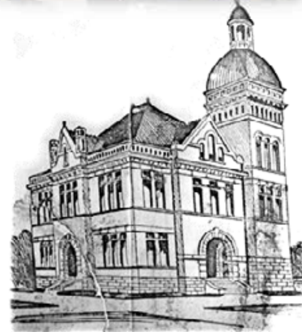
Second Vernon Parish Courthouse

Visit our website at www.VentureVernon.com or call 1-800-349-6287 for more information.